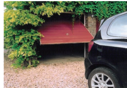
TM60: ideal for your door