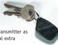
MINI transmitter as optional extra